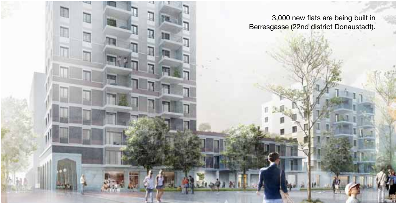
3,000 new flats are being built in Berresgasse (22nd district Donaustadt).

resgasse (approx. 3,000 flats, 22nd district), Käthe-Dorsch-Gasse (approx. 520 flats, 14th district), Henneberggasse 1-3 (approx. 80 flats, 3rd district) and Rösslergasse (approx. 80 flats, 21st district).