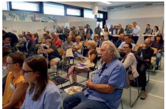
The GB* offices organise a variety of communication possibilities and information activities – for example the Sonnwend-ViertelTage event in autumn 2018.

With the beginning of a new three-year mandate for GB* in 2018, offices were also set up in the areas Nordwestbahnhof (20th municipal district), Neu Leopoldau and Donauefeld