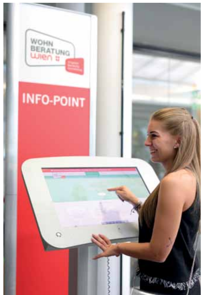
The digital services of Wohnberatung Wien can be accessed on the web or via touch screens at information points.

In 2018, the InfoCenter and MieterHilfe were combined to boost the available technical, material and organisational resources and be better prepared to deal with the growing demand for competent counselling.