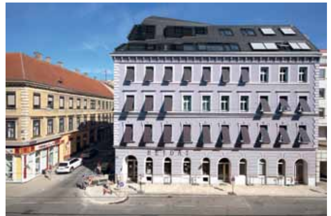
Mariahilfer Strasse 182: the rehabilitated building is now a gem within the cityscape.

The model of gentle urban renewal serves to upgrade both housing quality and the urban environment. Exemplary rehabilitation projects often win top prizes at the annual Vienna Urban Renewal Awards.