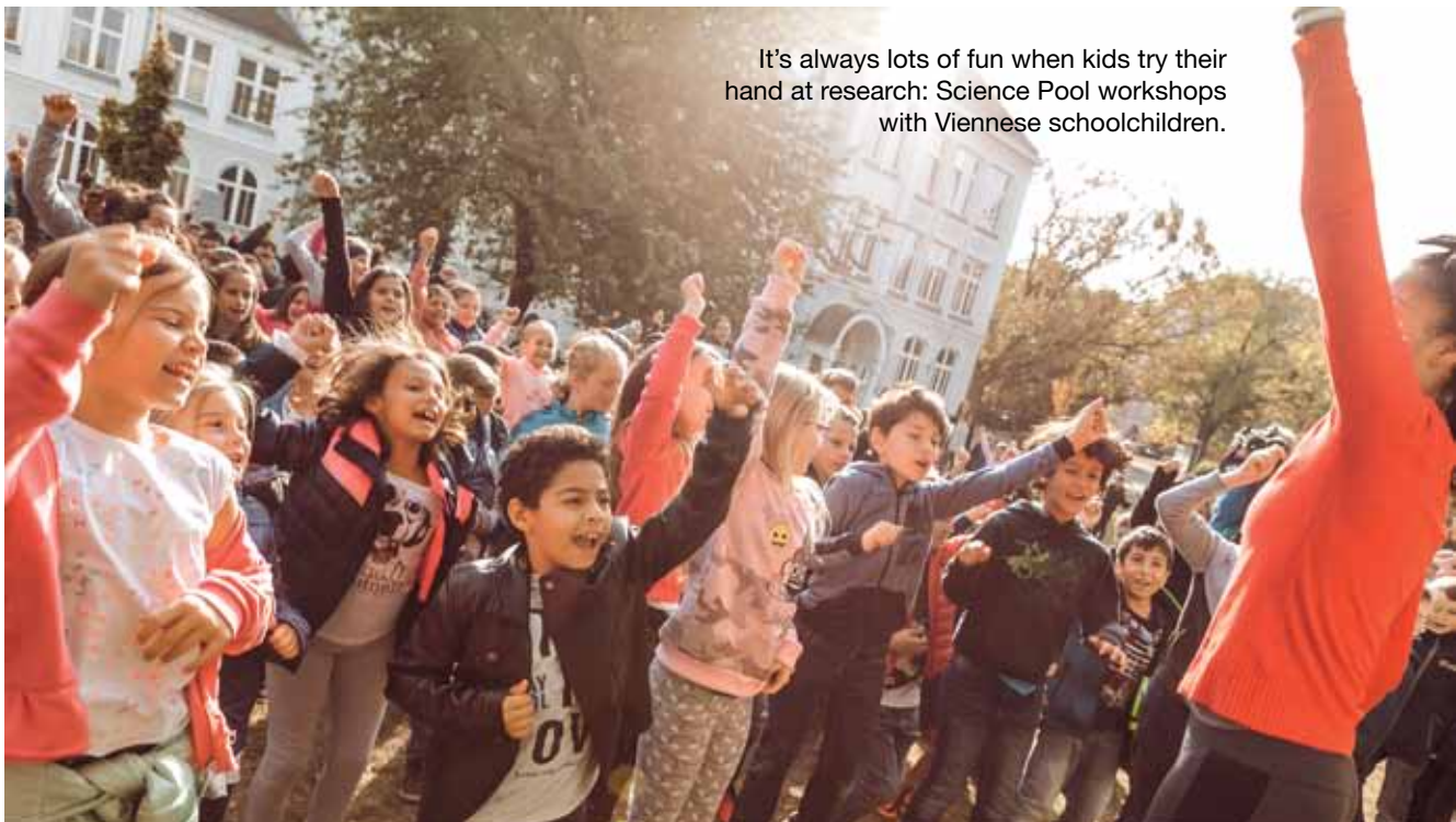
It's always lots of fun when kids try their hand at research: Science Pool workshops with Viennese schoolchildren.

Venice was inspired by Vienna's "SIMmobil", a mobile information and participation vehicle, which stopped at numerous neighbourhood events and was used by many local institutions including Science Pool, the Vienna Employment Promotion Fund (waff) or the youth workers of Balu&Du. In Venice-Mestre, an old bus was repainted and repurposed for a similar activity. Sofia (BG) showed interest in integrated mobility solutions, and Santiago de Compostela (E) inquired about energy solutions and efforts to involve tenants.