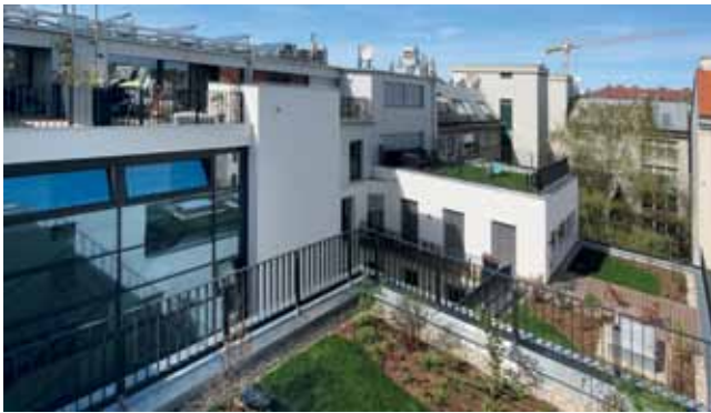
Recreation on top: roof gardens for residents.

In 2018, the Urban Renewal Award of the Vienna Construction Entrepreneurs' Guild was won by a very special project in Mariahilfer Strasse 182 (15th municipal district). After a severe gas explosion in 2014, which caused parts of the house to collapse, the structure was rebuilt and restored in exemplary manner thanks to the subsidies disbursed. The addition of balconies and a screen covering the interior courtyard created high-quality open and green spaces for tenants.