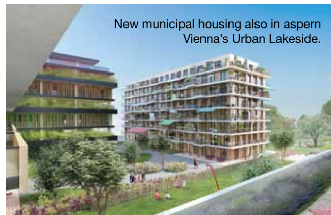
New municipal housing also in aspern Vienna’s Urban Lakeside.

The project situated in Wolfganggasse (12th municipal district Meidling) with 105 flats and an underground car park with 74 slots was presented in autumn 2018. All units feature a balcony or loggia. Green spaces will comprise a toddler playground and a shared play zone for older children and teens. Moreover, this Municipal Housing NEW development