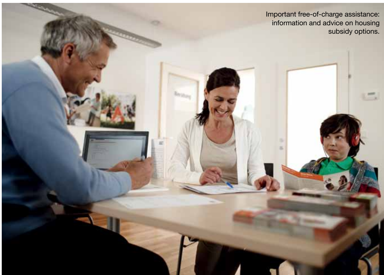
Important free-of-charge assistance: information and advice on housing subsidy options.

This decision of the Supreme Court was taken account of when revising the location premium map; thus the assessment of what constitutes an average location now takes the following form: