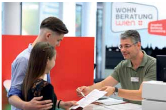
Free-of-charge and unbureaucratic: the services of Wohnberatung Wien are used by all generations.