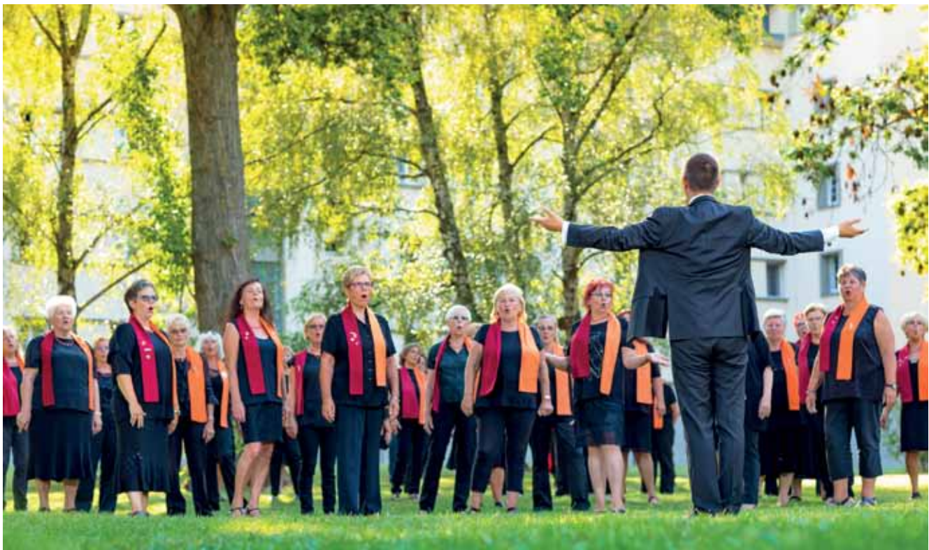
In 2018, the already very well-known “1st Municipal Housing Choir” celebrated its 10th anniversary. Its roughly 80 members enchanted visitors with a fantastic musical experience and also recorded their first CD.

partner also participated in the rapid response programme “Temporary Housing” for 2018. The programme aims at the interim utilisation of currently vacant lots.