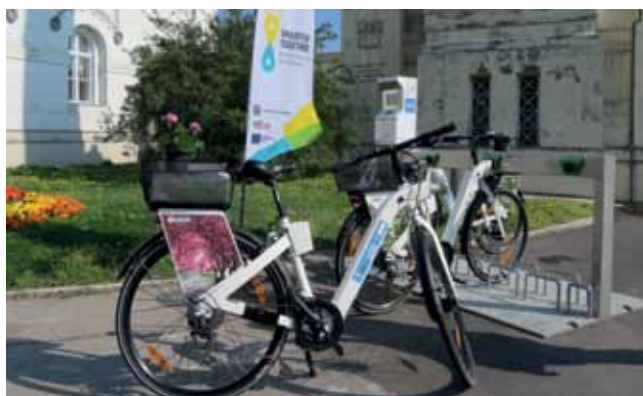
Smart: e-bikes help to cover long distances easily at Vienna’s Central Cemetery.

“Smarter Together has evolved into Vienna’s top smart city-inspired urban renewal initiative by offering a myriad of great solutions and innovations for a liveable, eco-friendly and socially sustainable city of the future. I think that Smarter Together is so forward-looking because it connects people, involves the economy, emphasises partnership-based co-operation of all actors and even enhances the attractiveness of Vienna as an international location”, in the words of the patron of the initiative, City Councillor Kathrin Gaál.