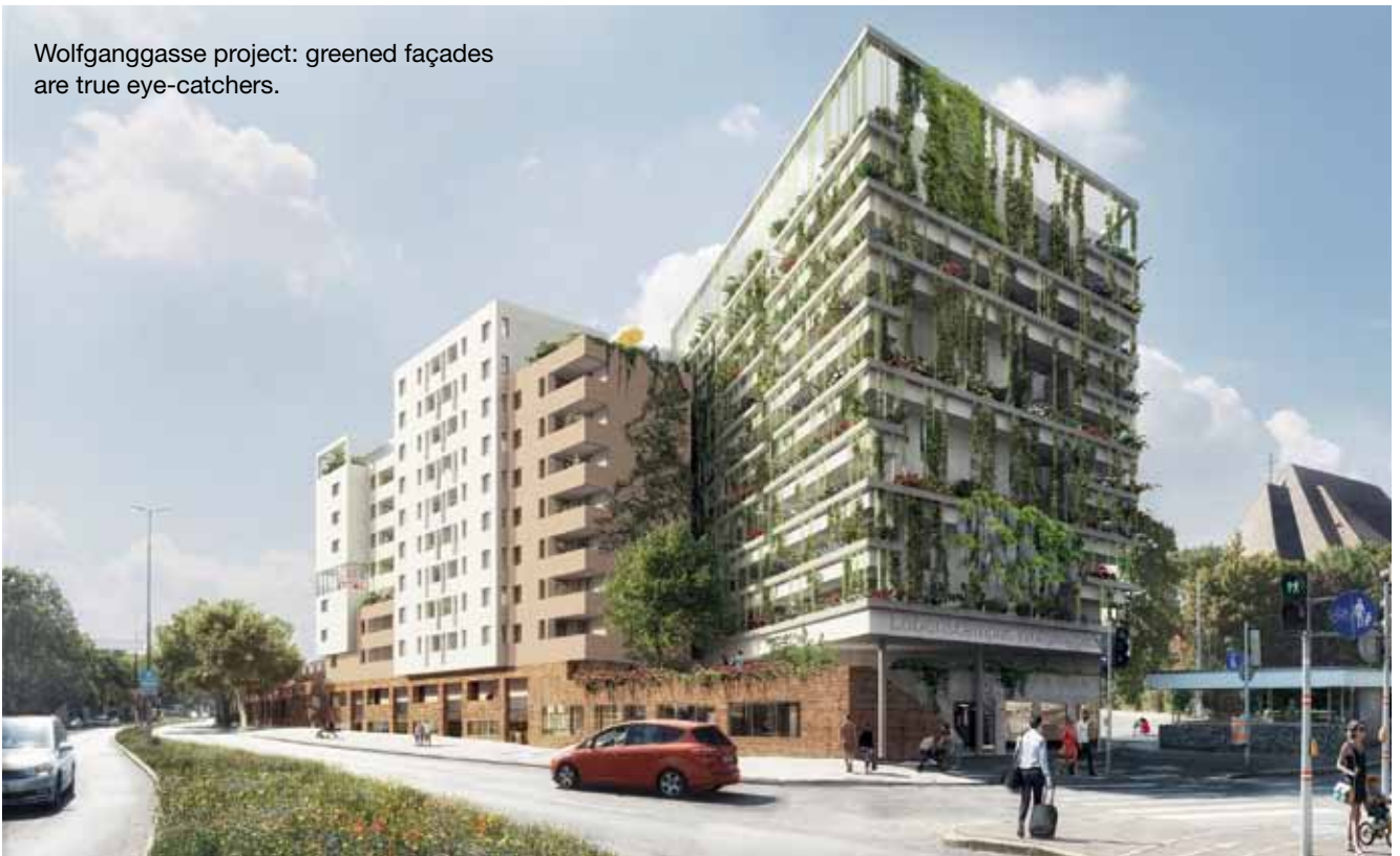
Wolfganggasse project: greened façades are true eye-catchers.

concerned self-build groups in Donaustadt, i.e. for the urban development areas OASE 22+ and Am Seebogen (in aspern Vienna's Urban Lakeside), totalling approx. 160 flats. This was followed by the competition "Small-scale Projects 2018" with locations in Anton-Haidl-Gasse 20-24 (17th district Hernals), Heiligenstädter Strasse 172 (19th district Döbling), Anton-Schall-Gasse and Herchenhahn-gasse 8 (21st district Floridsdorf) with approx. 130 flats total. In the second half of 2018, developers' competitions were conducted for Gundackergasse II (400 flats, 22nd district), Wolfganggasse (approx. 850 flats, 12th district), Ber-