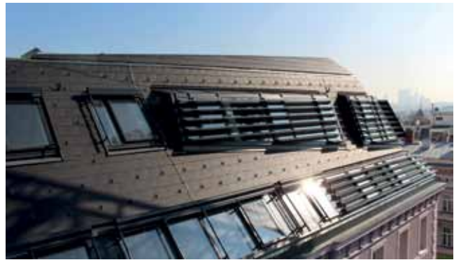
High-end architecture: modern roof storey conversion.

A special challenge was posed by construction site logistics. The position of the construction crane, the scaffolding in the interior courtyard as well as material transport (particularly from and to the basement) had to be planned very carefully. Sustainable thermal rehabilitation resulted in passive house standard both for the existing building and the new lofts. The use of new, innovative insulants reduced the heat demand by up to 90 percent. The architects chose hemp, an ecological building material, for insulating the new exterior walls. The richly detailed Gründerzeit façade was insu-