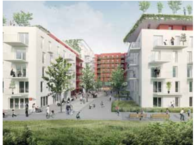
Käthe-Dorsch-Gasse, Lot B: open spaces as places of encounter and good-neighbourly communication.