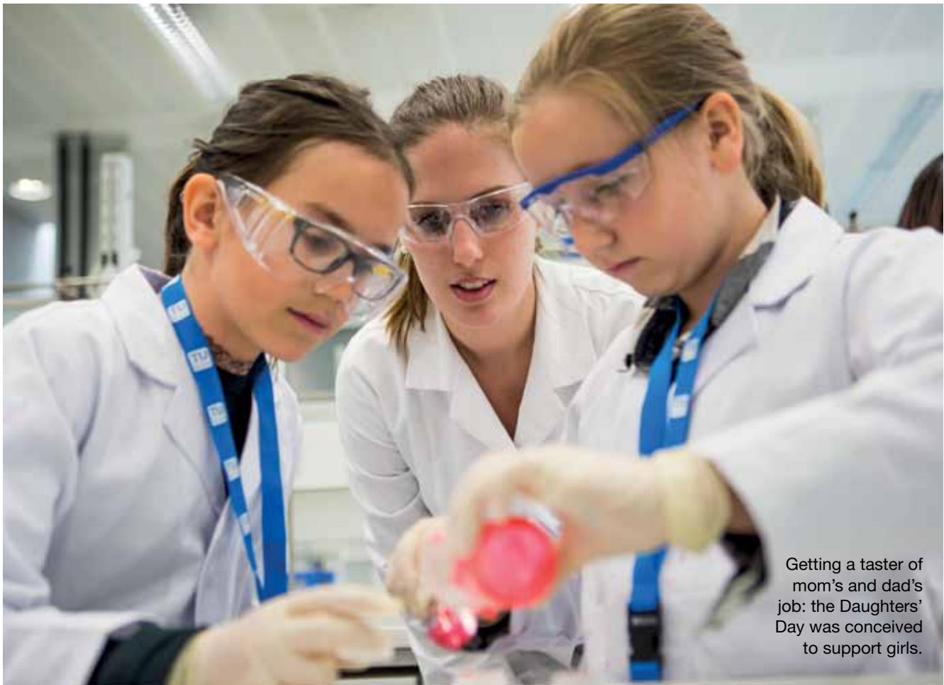
Getting a taster of mom's and dad's job: the Daughters' Day was conceived to support girls.

All information concerning this important topic can be found (in German) at: www.wien.gv.at/menschen/frauen/stichwort/gewalt/kampagnen/ko-tropfen/