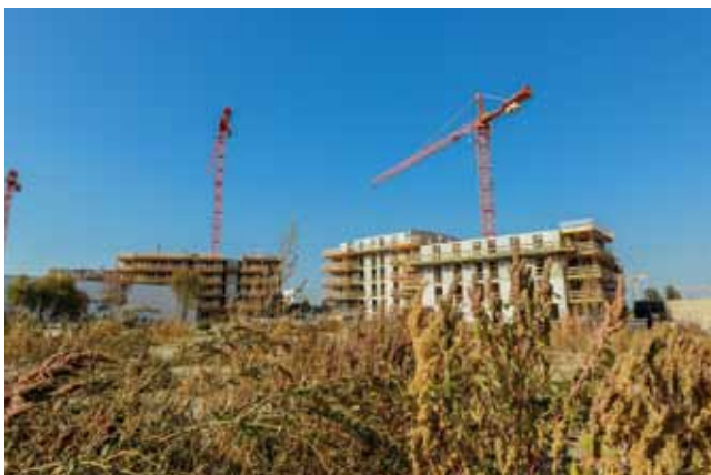
Lively new urban quarters are emerging – e.g. in Atzgersdorf and In der Wiesen (23rd municipal district of Vienna).

(21st municipal district), Berresgasse (22nd municipal district) as well as In der Wiesen and Atzgersdorf (23rd municipal district).