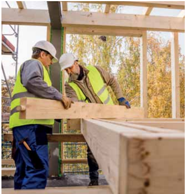
Modern housing: new attic flats in municipal estates create new, cost-efficient housing for Vienna.

Vienna offers the highest quality of life at a European level. This is not by chance, but also stems from the daily work of thousands of employees of the City of Vienna and its enterprises. Intensified co-operation between departments and divisions and the resulting creation of links and synergies are important because successful collaboration is more than the sum of individual achievements. Highlighting and honouring joint projects and co-operation ventures within the City of Vienna is therefore the declared goal of the Golden Baton Awards. In 2018, this resulted in two awards for Wiener Wohnen. Among 112 entries submitted by more than 140 departments and organisations of the City of Vienna, Wiener Wohnen received prizes both for its project "GEMEINSAM.SICHER" ("Safe Together") and for its co-operation with the municipal second-hand shop "48er Tandler" for waste avoidance through the reuse and sale of objects and utensils at a dedicated store.