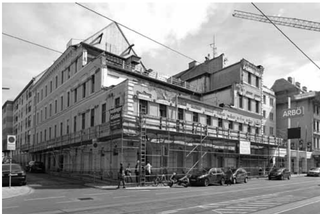
Mariahilfer Strasse 182: façade of this residential building after a gas explosion.

Already in June, an amendment to the Building Rehabilitation Ordinance extended the range of subsidies for the rehabilitation of residential buildings. To create an additional modernisation incentive for building owners, access to highly subsidised comprehensive rehabilitation was facilitated to include buildings above the “sub-standard” class. The new subsidy scheme for roof storey conversions and additions – independently from building rehabilitation proper – creates a fresh impulse as well.