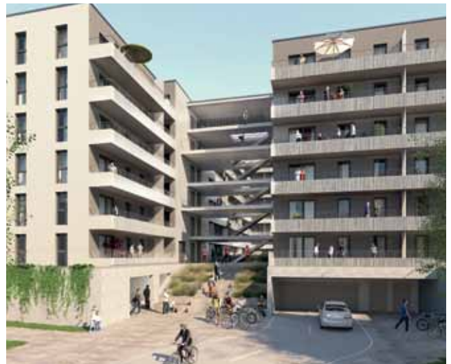
Käthe-Dorsch-Gasse, Lot A: varied options meet highly diverse housing needs.

square metres total. The roughly 520 flats will boast well-thought-out layouts and individual outside spaces. Single parents will find affordable flats that correspond to their needs and in part will require no equity contribution while featuring diverse spaces for communal activities. Further facilities will include shared flats and a residential home and café for elderly persons.