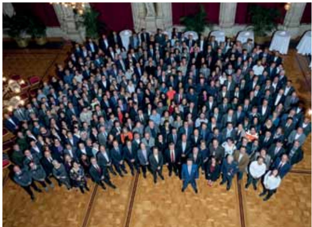
Bird's eye view: selected projects of Wiener Wohnen were honoured at Vienna City Hall.