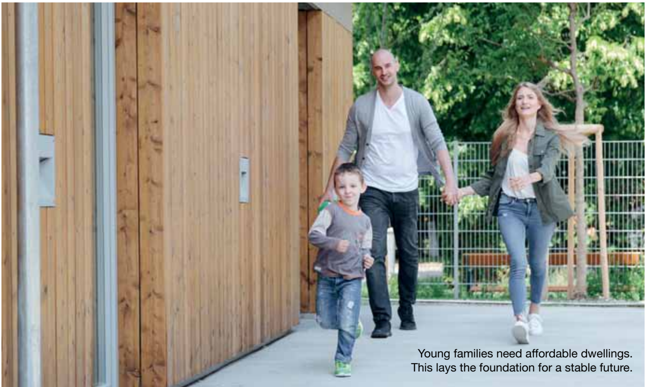
Young families need affordable dwellings. This lays the foundation for a stable future.

In the period under review, the Housing Research Division specifically analysed selected megatrends with a bearing on housing issues. After all, a deeper understanding of such questions as digitalisation, global warming, urban growth