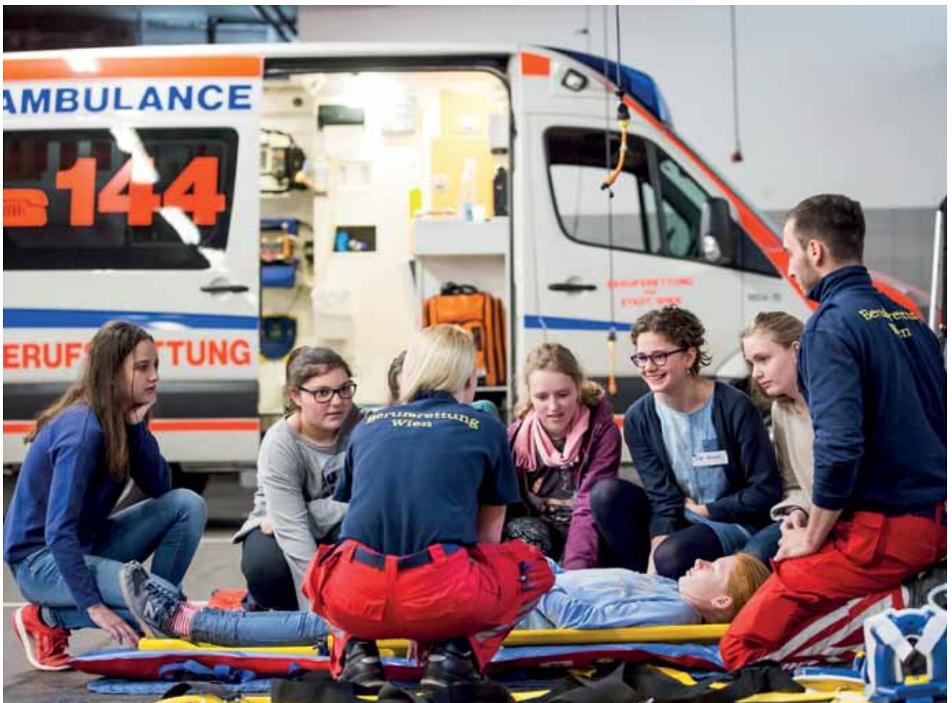
First aid: basic training at Municipal Department 70 – Vienna Ambulance Service on Daughters' Day.

In autumn 2018, the large-scale study "So leben wir heute ... Wiener Industriearbeiterinnen berichten über ihr Leben. Auf den Spuren Käthe Leichter" ("That's how we live today ...") was presented. 85 years after Käthe Leichter's seminal study, the paper looks closely at the current situation of female industrial workers. www.wien.gv.at/